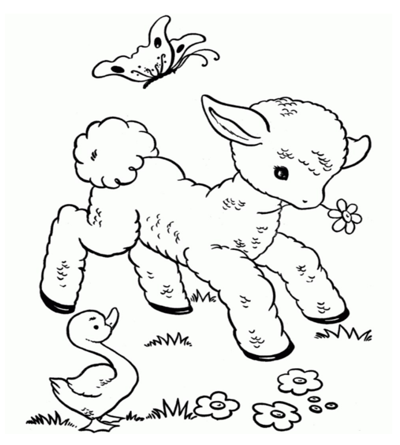
God makes all things new again. Even me!